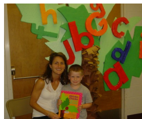
Storywalk at Derry's Grandview Elementary August 2009

School Readiness provides funds to assist districts carry out these activities to familiarize children with the public school they will attend. Some of these activities include field trips by preschoolers to the school they will attend, visits by kindergarten teachers to the preschools.