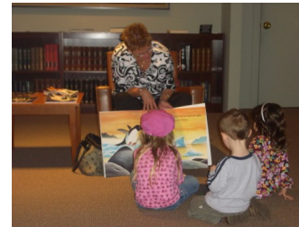
Story time at "The Westmoreland" Museum

The month of April has been designated by the National Association for the Education of Young Children as the Month of the Young Child .